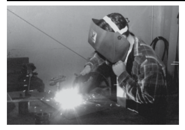
Photos: (1- welding without gloves or jacket, 2-getting ready to weld with all proper safety equipment)

Critique: One of these photos show obvious safety violation, no welding gloves or jacket. Make sure your photos show safety in practice.